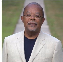
Henry Louis Gates, Jr.